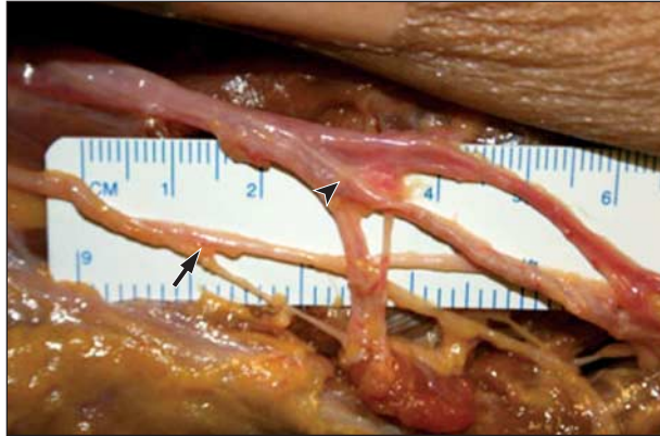
Figure 2. Relation of the nerve to the vastus lateralis (arrow) to the descending branch of the lateral femoral circumflex artery (arrowhead).

The apparent redundancy and lack of consequences with nerve sacrifice make the MNVL an enticing option