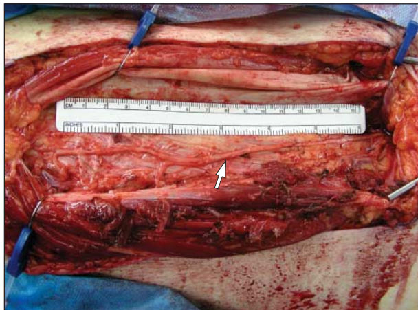
Figure 3. The large-caliber, redundant motor nerve to the vastus lateralis (arrow) courses along the ALT resection bed in a flap harvest.