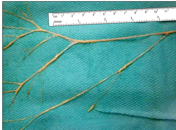
Figure 1. Anatomic specimen of the nerve to the vastus lateralis with extensive arborization.

The vastus lateralis is the largest of the quadriceps muscles. It receives motor innervation through a branch of the femoral nerve, namely the MNVL. Although the vascular supply and sensory innervation of the lateral thigh have been well described, there are few studies addressing the mo-